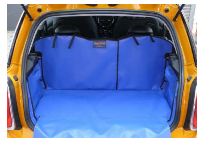
Please note: Photo shows a Rear Plus Cargo liner with additional Bumper Flap